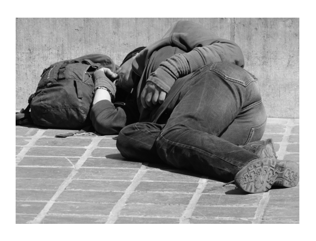
SNAP Benefits for The Homeless